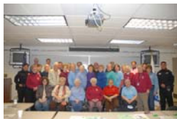
VIPS Annual Training Group Photograph